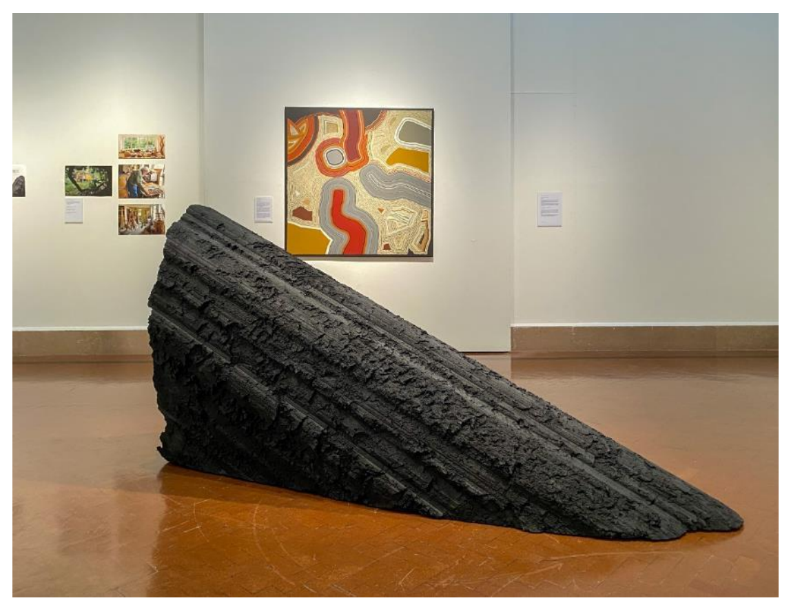
A Shared Love of Landscape (12 November 2022–4 March 2023) brought together works by four generations of the Hitchens family, including this sculpture, Dark Shadow Falling (2021), by Simon Hitchens © The Artist