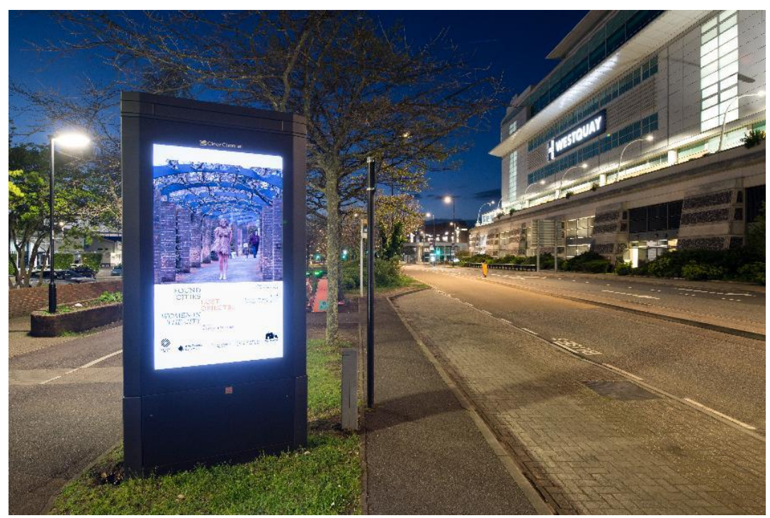
Billboard commission, 2023