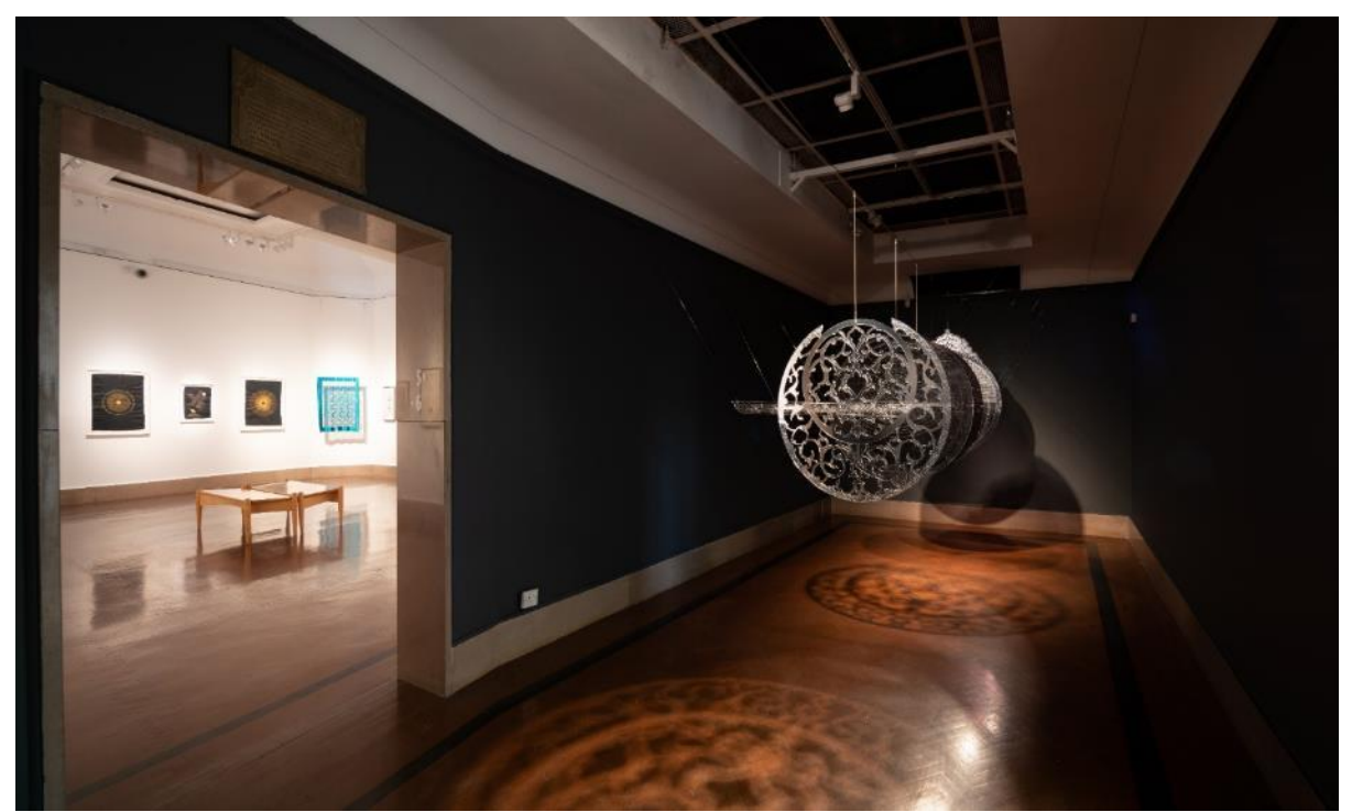
Installation view of Manifesting the Unseen, showing Siraat, 2021, by Sara Choudhrey © The Artist, image: Joe Low