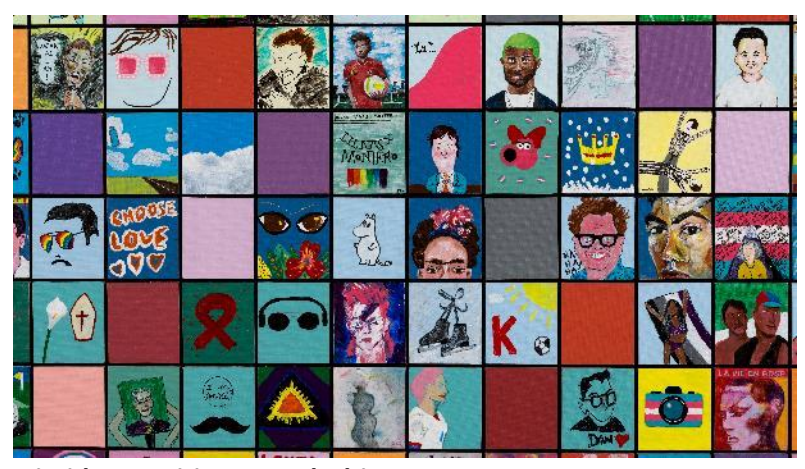
Lubaina Himid: Lost Cities, Found Objects

Selection of portraits created for Portraits of Inspiration , 2022–23