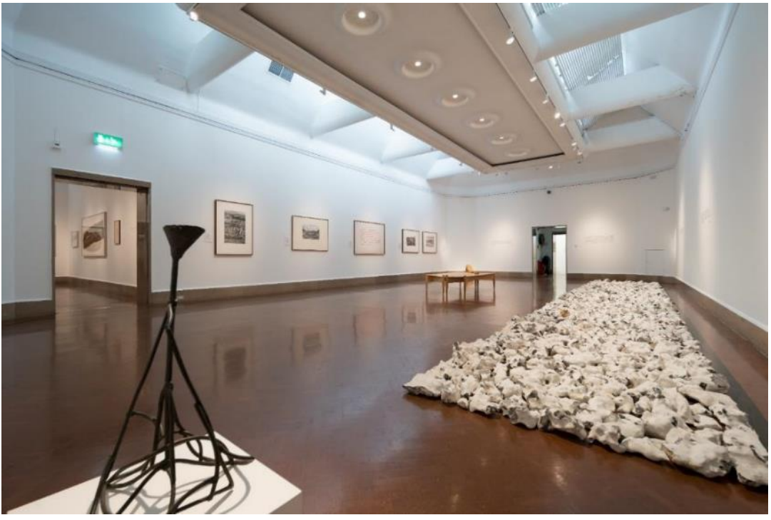
Installation view of Earth Art: The Common Ground, 2022, image: Joe Low