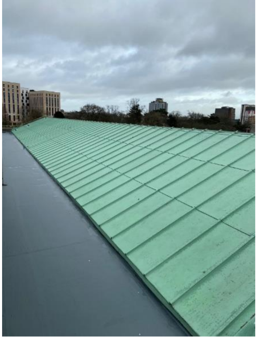
New Copper Roof over the Main Hall, Jan 2023

In January 2023, Southampton Forward and its founding partners (Southampton City Council, Solent University, University of Southampton, GO! Southampton, Paris Smith, Mayflower Theatre) secured £1.5m investment to deliver key UK City of Culture legacy projects, which will include the Art Gallery and other partners.