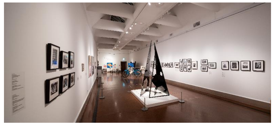
Lost Cities, Found Objects, 2023, installation view, image: Joe Low

Curated by Turner-Prize winning and internationally renowned artist Lubaina Himid CBE, inviting viewers to consider the experiences of women in the city, as seen through the lens of art. The works in the exhibition were primarily drawn from the Arts Council Collection, supported by Southampton's collection, including Eva Rothschild, Gillian Waring and Alison Turnball.