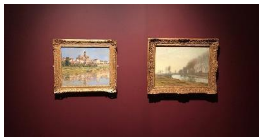
Both Monet's on display in Creating a National Collection, 2021

• The frame for Claude Monet's The Church at Vétheuil which had been sent for conservation in October 2020 was displayed in its conserved state for the first time in the Creating A National Collection exhibition (28 May – 4 Sept 2021) alongside another Monet from the National Gallery, The Petit Bras of the Seine at Argenteuil.