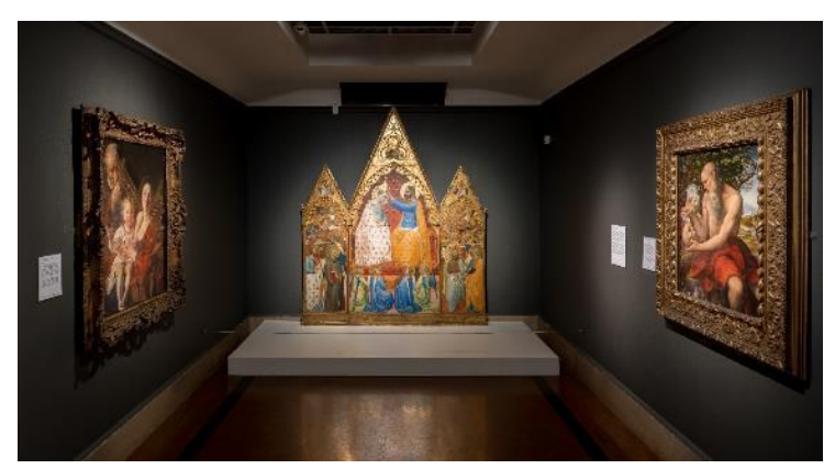
The Renaissance Room, installation view, February 2022, image: Joe Low